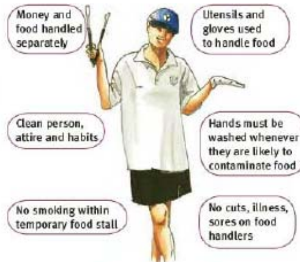
Fig. 2 Illustration of a Food Handler